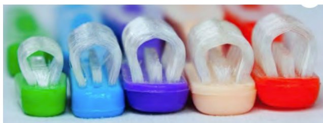
SURROUND STYLE TOOTHBRUSH

https://www.amazon.com/Surround-Toothbrush-Pack-purple-green/dp/B01KGI3YB2