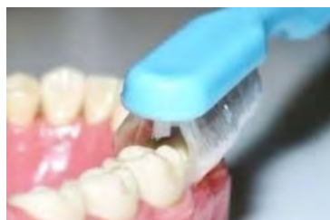
COLLIS CURVE TOOTHBRUSH